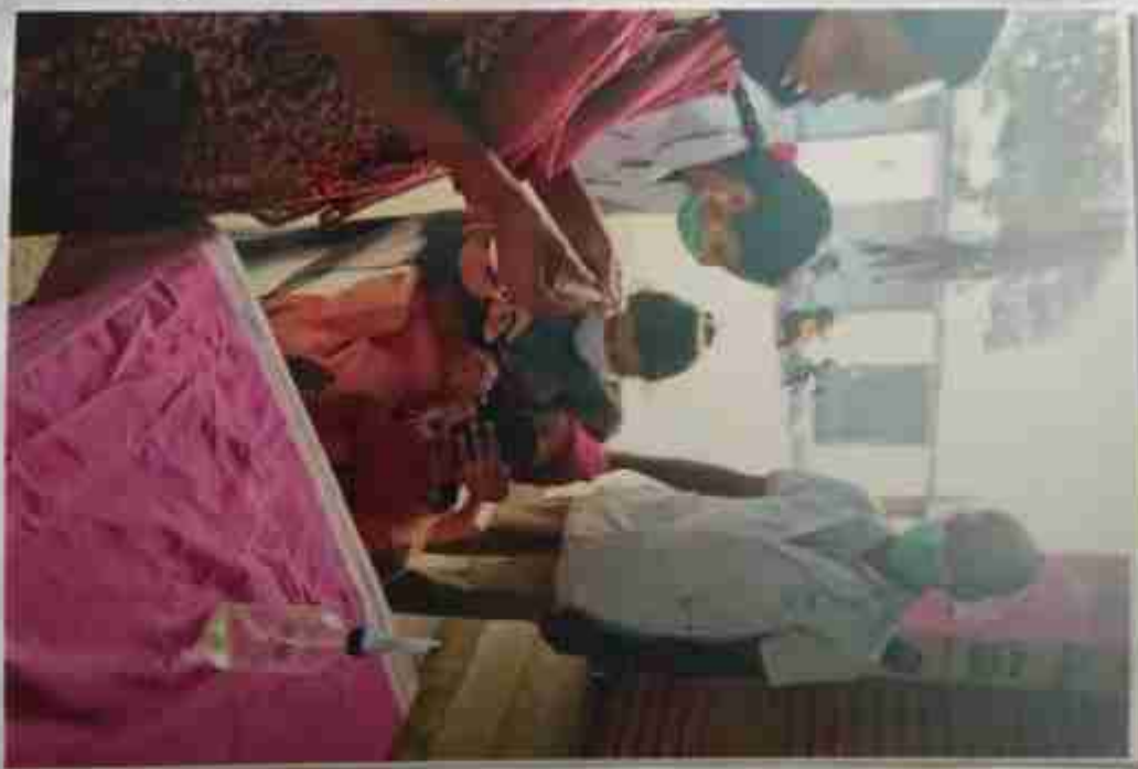
Pulse polio Camp at PHC, Vadakkangulam