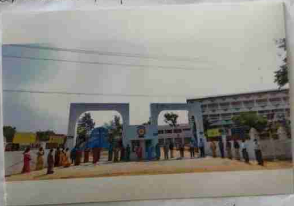
Women awareness among staff