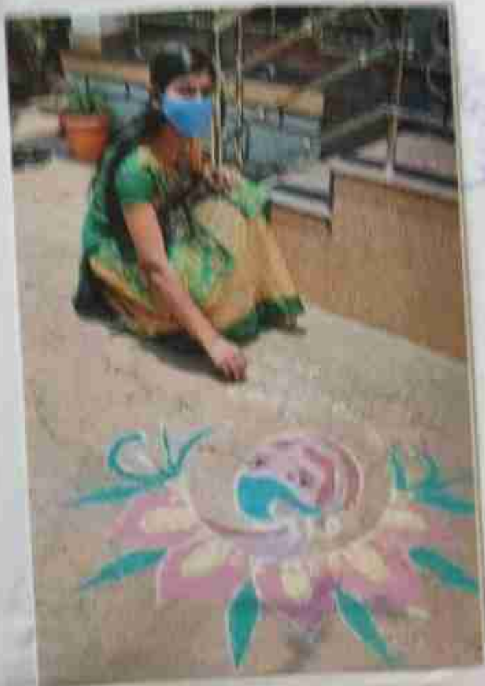
Creating awareness about - Rangoli, posters at the Dr. Arun Medical trust, Guadelmas.